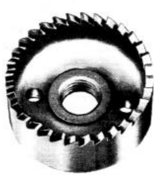
MM300 Fine Tooth

ARBOR HOLES : Diameters - 3/8" through 3 1/32" - 5/16" 24 thread 1" through 2 31/32" - 1/2" 20 thread 3" through 4" - 3/4" 16 thread