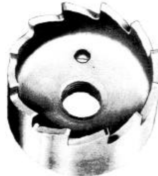
MM310 Coarse Tooth